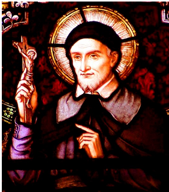
Saint Vincent de Paul

Service hours must be listed on the Works of Mercy Summary Form found on page 11 of this packet.